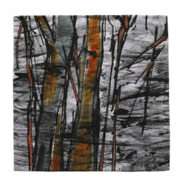
Judy Hooworth Summer Sketch