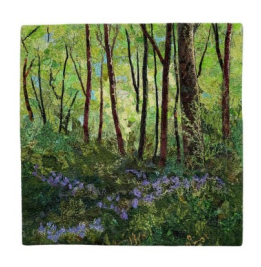
Ethelda Erasmus Bluebells in Corrig Wood